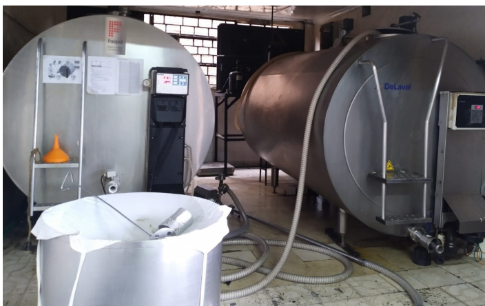
Milk coolers at Kiriita Cooperative Society premises in Kiambu.

Other challenges mentioned are lack of veterinary services and knowledge on value addition and unpredictable weather patterns.