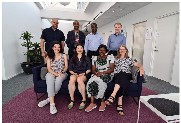
Visiting PhD fellows with AAU mentors.

Conferences aim to bring together leading scholars (between 150 - 200) working on I&D in Africa and other actors interested in the I&D field. To date AfricaLics has organized 4 research conferences, which are held after every 2 years.