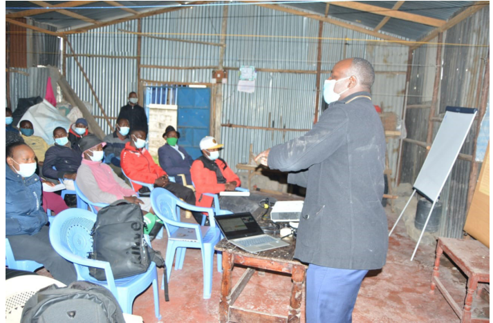
One of the community engagement fora by the Nairobi Risk Hub to understand perceptions and of risks among stakeholders.

Community level engagements at community levels focused on poverty, high cost of living exacerbated by COVID-19, insecurity, land access and affordable housing. Local leaders attributed high poverty to perennial floods and fires which tend to occur concurrently due to high exposure (e.g. markets located near rivers) and dynamic vulnerabilities to environmental and physical factors like poor basic infrastructure.